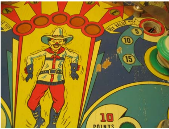
Playing surface showing wear from play.