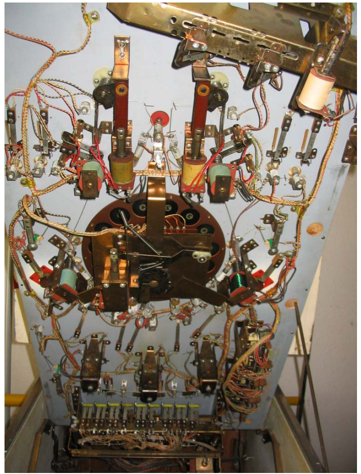
Underneath playing surface.