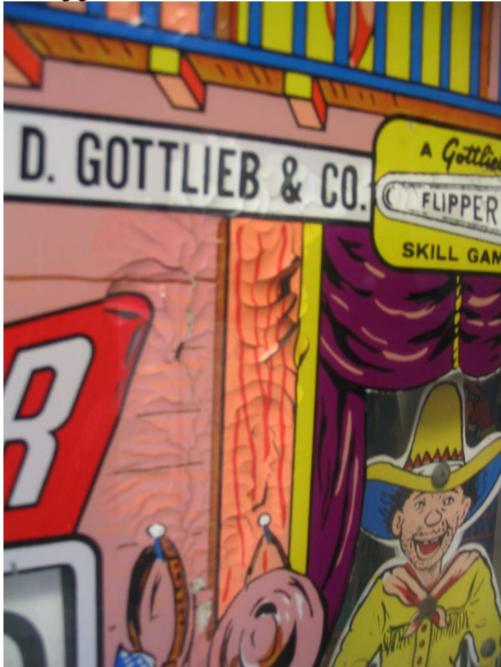
Close-up of paint peeling on scoring surface.