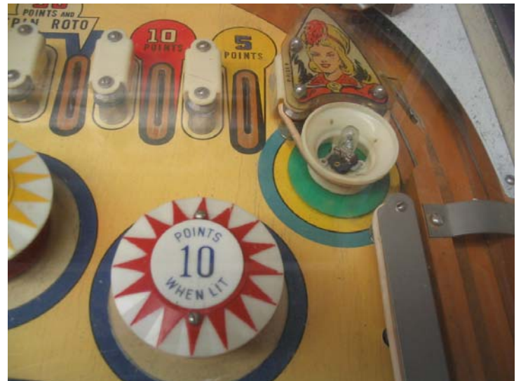
The only missing piece (that I know of).