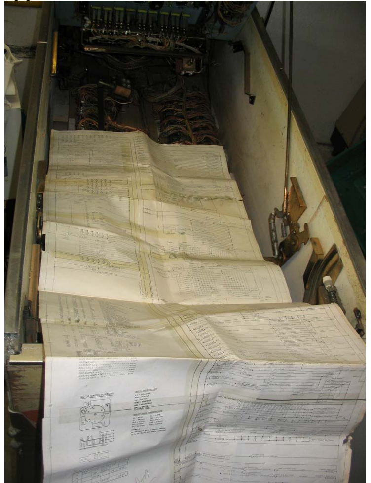
Includes the schematic.