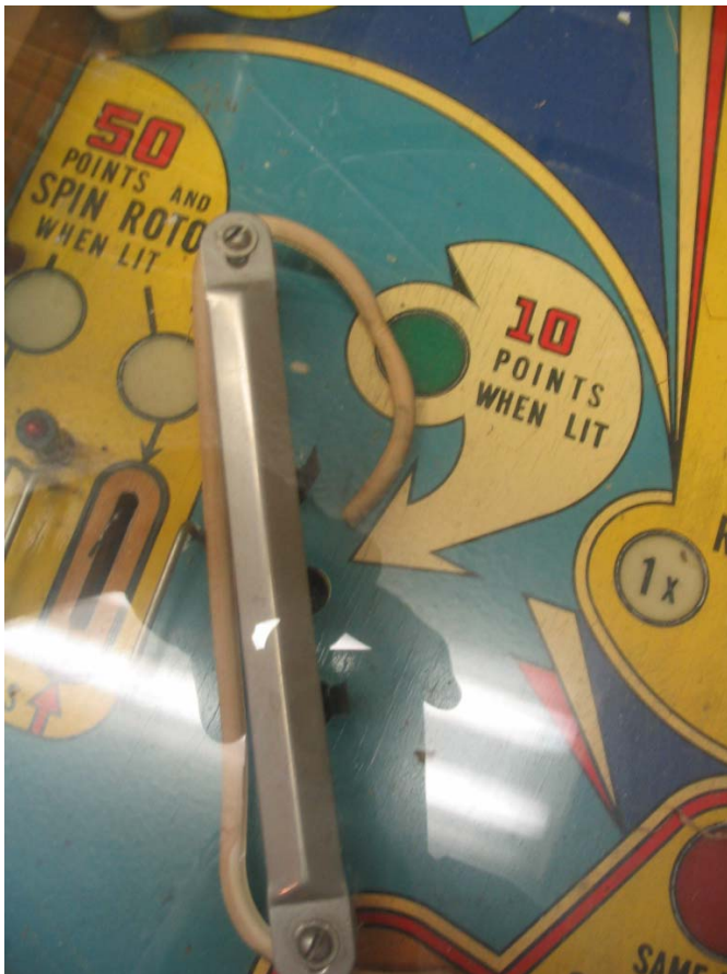
Most of rubber needs to be replaced. I suppose this is typical wear.