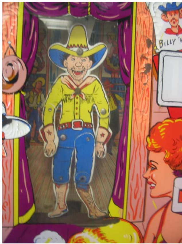
Dancing cowboy needs a little work on his left leg.