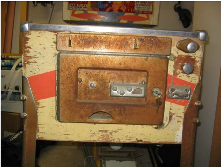
Coin door shows signs of rust, needs paint.